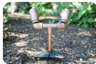
Two Craftsman Bullets with 6" (CCPSTEM6), (CCPT1) connection and Talon Stake (CTSL1).