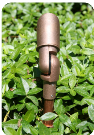
Craftsman Bullet Light with 4" (CCPSTEM4) & (CCPC1) Coupling.