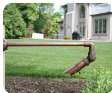
Impressionist Tree Light with the (CCPL1) Elbow connection, 12" (CCPSTEM12), and the mounting canopy (CFM1CBS).