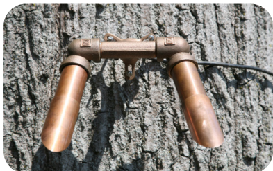
Two Impressionist Tree Lights with the (CCPT1) connection, 2" (CCPSTEM2), and the tree mounting canopy (XCBPTMC1).