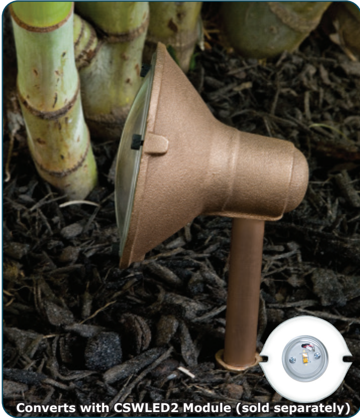
Converts with CSWLED2 Module (sold separately)

CAST Solid Bronze Wall Wash Light - For Wide Beam Applications